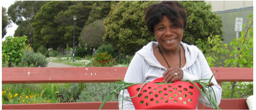
Richmond resident harvesting from the Greenway

The BGC could potentially provide a wide range of opportunities for local food businesses on its new campus. One approach to this would be to incentivize locally-owned food businesses and businesses owned by members of marginalized communities to contract with and become vendors on the new campus. These contracts should include responsible contracting policies to ensure that any and all food jobs ensure worker security, equity, and health. In so doing, the campus would create local jobs and opportunities to start new businesses that help support the local economy and social sustainability. The new campus can also institute a weekly farm stand and promote Community Supported Agriculture boxes on the new campus that feature local produce from organizations like Urban Tilth and other local growers in Contra Costa County. These farm stands could also implement a “Double Up Food Bucks” program so that customers can purchase goods with their EBT (electronic benefit transfer) cards to improve food access for low-income individuals. “Double Up Food Bucks” is a statewide incentive program that doubles the value of CalFresh benefits when used for fresh, locally-grown fruits and vegetables at farmers’ markets and grocery stores. An initiative like this would create a direct pathway for local farmers to sell to local residents while also providing whole, healthy foods to students, workers, staff, and faculty at the Berkeley Global Campus.