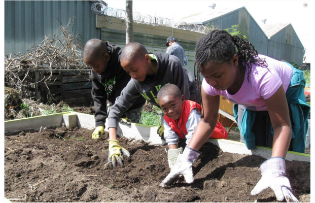
Richmond youth till soil at Adams Crest Farm

In addition, Richmond still faces extreme underenrollment in California's Supplemental Nutrition Assistance Program (SNAP), CalFresh. According to the Contra Costa County Employment and Human Services, approximately 40 percent of Contra Costa County residents who are eligible for federal food assistance programs are not enrolled. No data was available for underenrollment percentages in the city of Richmond, but it is possible that this percentage is higher than 40 percent for Richmond residents. This is despite the fact that enrollment in Contra Costa County's CalFresh program has increased 410% from 2006 to 2014. Currently, there are about 6,000 Richmond households (approximately 15,000 individuals) enrolled in CalFresh, out of a total population of 107,571. 21 There are many factors that can contribute to these gaps in enrollment, including: language barriers, fear that enrollment will impact immigration status, stigmas tied to federal assistance programs, misinformation about eligibility and benefits, administrative churning, and individuals thinking the benefits are too low to go through the hassle of enrollment. Finally, there is also the added barrier that the most recent 2014 Farm Bill has prohibited the use of federal funds toward advertising for SNAP or CalFresh programs. 22