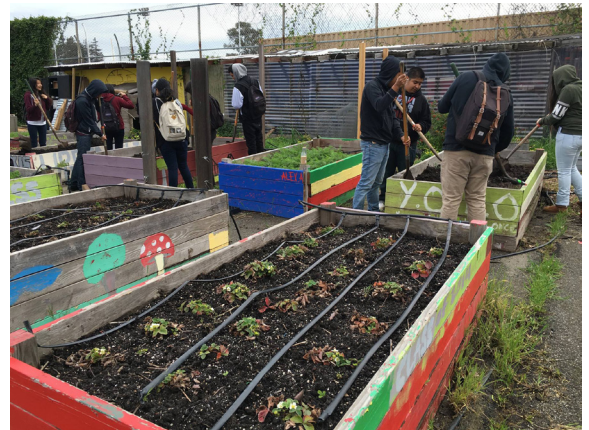
School garden in Richmond

A recent study analyzing access to food in Richmond found that about 32,000 people (34 percent of the study area population) in Richmond reside in "critical food access areas," or "areas considered underserved when compared to the study area as a whole." 17 These areas include North Richmond, the Iron Triangle neighborhood, and South Richmond. On average, Richmond residents must travel almost a mile to reach a full service grocer, though some residents must travel even further to access food. Given that approximately 10 percent of households in Richmond do not have a vehicle, these distances to food retailers have a significant impact on accessibility to whole and healthy foods. 18 According to the same study, these food challenges, and resulting health