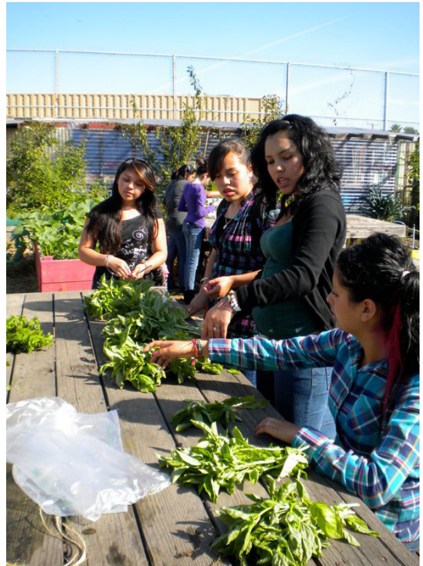
Richmond youth gathering basil from a local garden

This paper provides a general overview of food systems and community health, followed by a description of the current landscape of existing food challenges and food equity efforts in Richmond and food-related work at UC Berkeley and within the Global Food Initiative. The final section presents strategy recommendations that can bridge these broad-based initiatives housed within community, city government, and academia in a way that includes and centers the needs and contributions of marginalized communities. In so doing, these efforts can be better aligned to optimize meaningful collaborative work that can enhance opportunity structures within the food system in Richmond and UC Berkeley. Lastly, this paper aims to bring discussions around