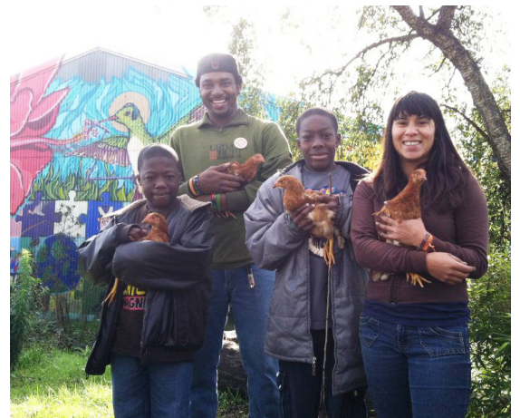
Richmond youth holding young chickens

A focal point of food equity and community health work in Richmond is Unity Park, a newly formed park on the Richmond Greenway – a 1.5 mile-long area that was previously railroad