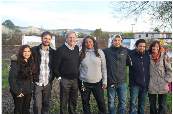
California Congressman Mark DeSaulnier with the Urban Tilth team in Richmond, California

UC Berkeley’s Haas School of Business could provide technical assistance related to financial planning and business models for small businesses, small farms, and community-based organizations working in the food and agriculture sector. The Social Sector Solutions program in the Haas School of Business already partnered with the City of Richmond and published a report entitled, The Richmond Bay Campus Report: Strategic Business Plan and Marketing Strategy Positioning Richmond for Success , 47 which outlines a strategic business plan for the new Berkeley Global Campus that focuses on best practices for procurement as well as a marketing strategy for the City of Richmond. 48 Similar efforts could be made to follow-up on this type of research and work directly with local stakeholders in Richmond’s food economy to support their sustainability, impact, and growth.