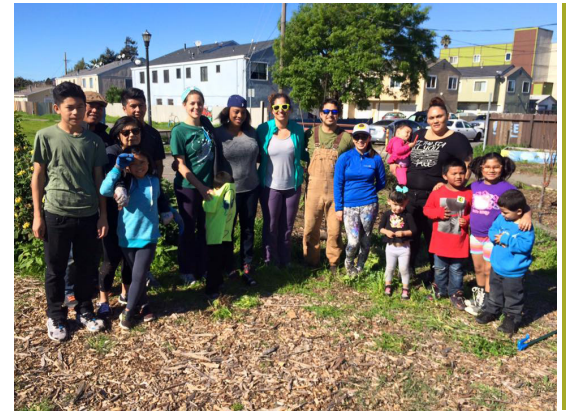
Volunteers working at garden on Richmond Greenway

While these food procurement goals are commendable, there is still room for improvement—not only in procurement, but also to better ensure that small to mid-sized farms have access to local markets. In addition, procurement strategies at UC Berkeley could be leveraged with other anchor institutions so that they have a broader reach and impact on the regional economy and local community. 38 Cal Dining has expressed interest in finding pathways to improving food sustainability and access at UC Berkeley. The Global Food Initiative aims to advance these issues as well. Some of the strategies mentioned in the next section might have the potential to achieve many of the goals of the GFI, BGC, and Richmond city government and community.